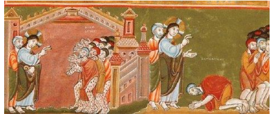
The Cleansing of the Ten Lepers