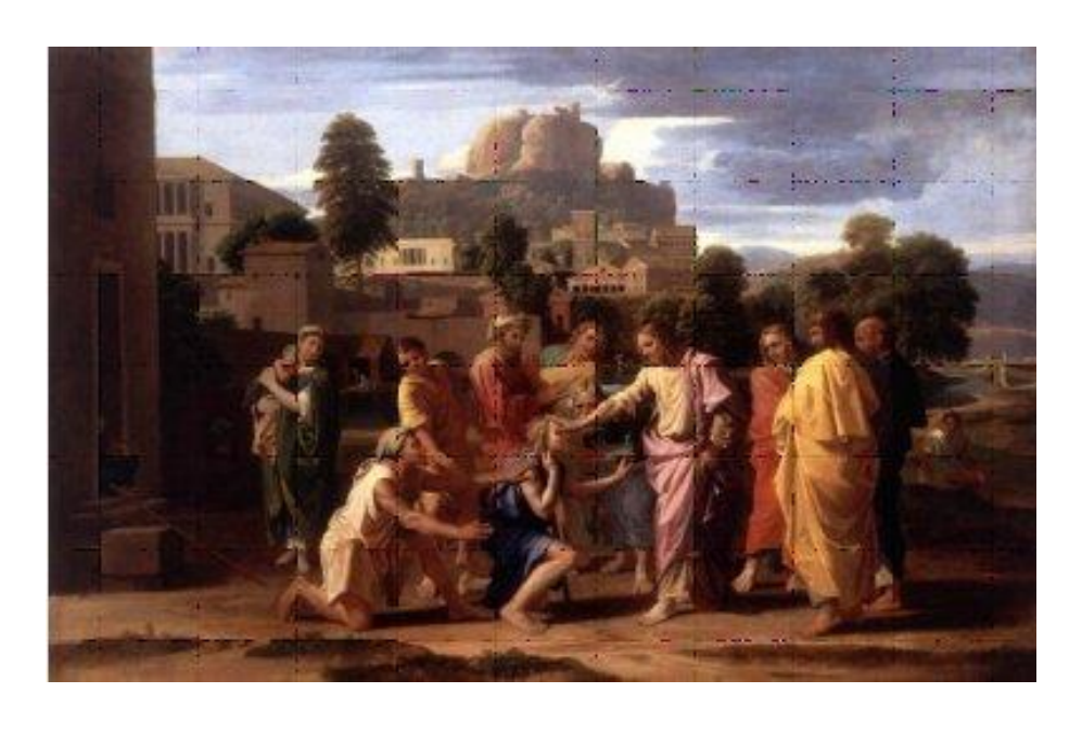
Jesus heals the blind man of Jericho