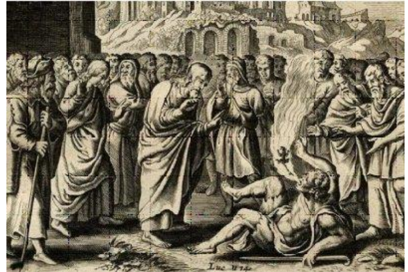
Jesus was casting out a devil