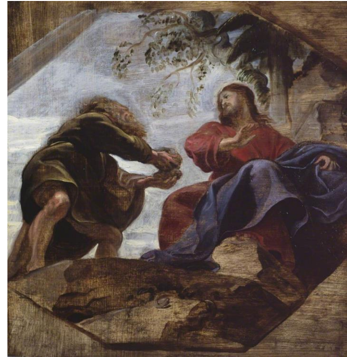
Then was Jesus led up by the Spirit into the wilderness to be tempted by the Devil St. Matthew 4.1