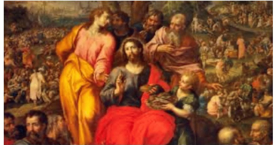
Jesus said, "I am the Bread of life"

The Nineteenth Sunday After Trinity Annual Observance of Thanksgiving October 10, 2021