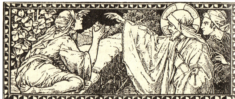
Jesus heals the Blind Man

The Sunday Called Quinquagesima February 23, 2020